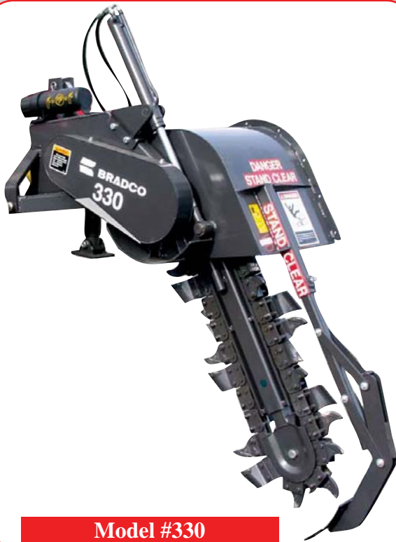
Model #330 For Tractors 15 - 30 HP