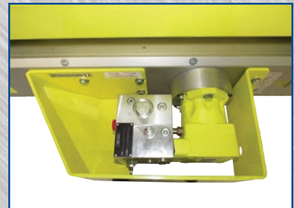
Hydraulic motor, block & protection guard