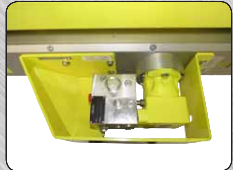
Hydraulic motor, block & protection guard