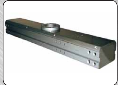
Saw blade housing module