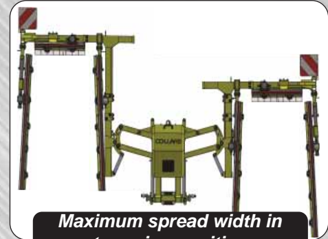
Maximum spread width in terracing position