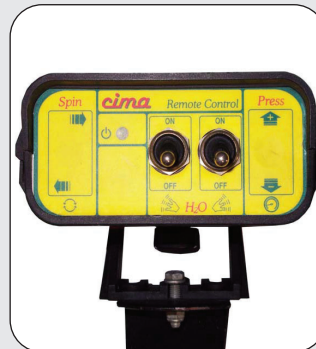
Electro valve controls to operate on, off, left, and right spraying