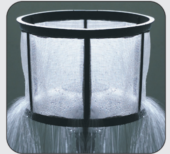
Shower head is built into the main strainer basket to easily put wettable powders into suspension