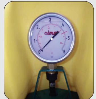
Large 3" dia. glycerine filled gauge, easy to see from tractor seat

Specifications Subject To Change Without Notice