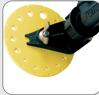
Rotating yellow calibration discs, adjusts easily to provide accurate and constant regulation of application