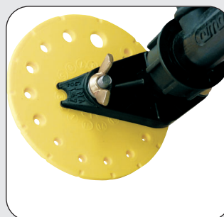
Rotating yellow calibration discs, adjusts easily to provide accurate & constant regulation of application