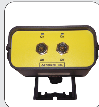
Electro valve controls to operate on, off, left, and right spraying