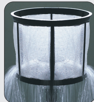
Shower head is built into the main strainer basket to easily put wettable powders into suspension