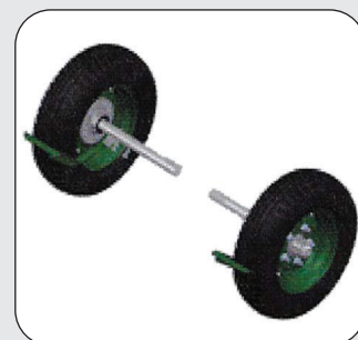
Bolt-on assist wheels are re- quired when sprayer is mounted on a crawler tractor