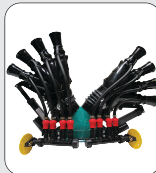
Electro cylinders with control box operated from tractor seat (inner spray heads)