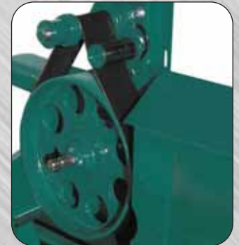
Power band fan speed up system with built-in overrunning clutch