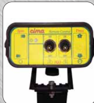
Electro valve controls to operate on, off, left, and right spraying