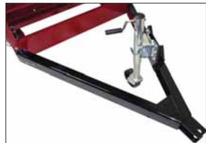
Dolly Wheel Jacks Standard on C-25GD and C-50GD