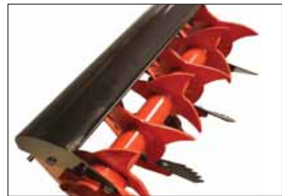
Upper beaters standard on C-25GD and C-50GD