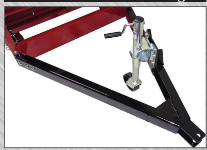
Dolly Wheel Jacks Standard on C-25GD and C-50GD