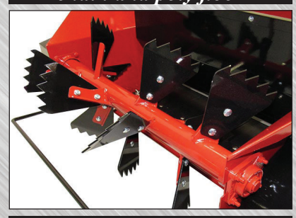
Replaceable Beater Paddles With Rooster Comb Design