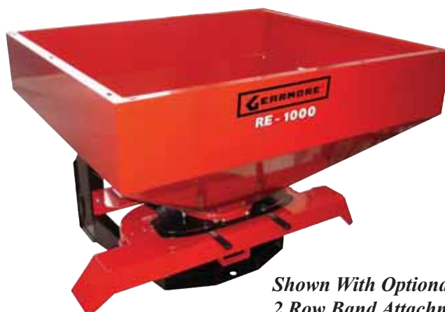
Shown With Optional 2 Row Band Attachment

Our 2300 pound, 35 cubic foot capacity spreader features twin stainless steel spinner discs which are extremely accurate with only 6.7% variance across the spread pattern. The spreader has dual levers to set the pounds per acre and hydraulic cylinder for off and on. The lever allows for easily setting the spreader for 180°, 90° right or 90° left hand spread. An important option is the two row band spread attachment for spreading material down row lines.