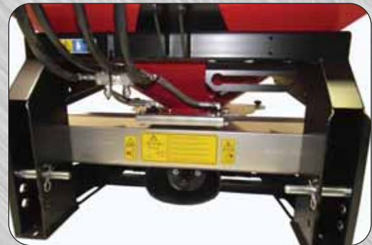
Dual cylinders for right & left shutters on & off