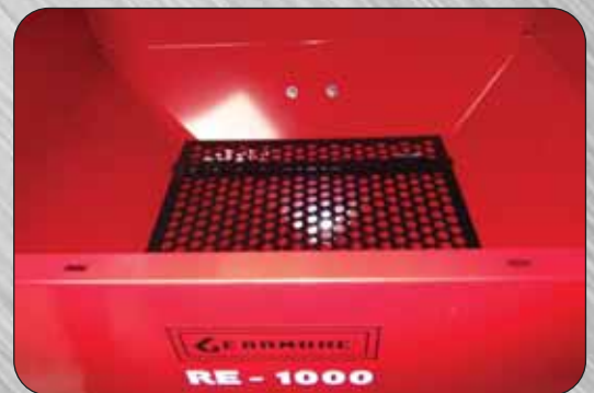
Screen To Stop Large Fertilizer Clods