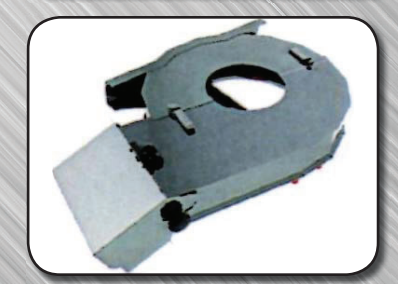
Stainless steel side conveyor to spread down the row line