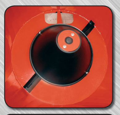
Coned material diverter and full length agitator blades