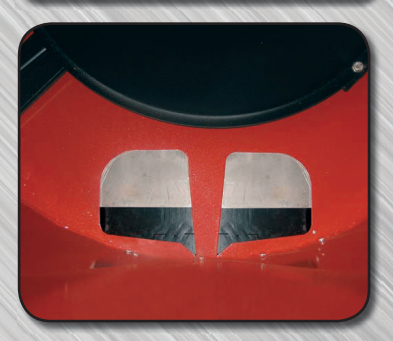
Two large shutter openings for the release of bulky material