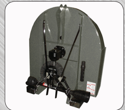
Round Back Design