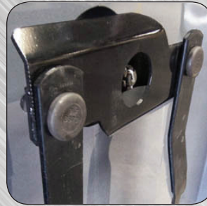
Heavy 1/4" Thick Beveled Spindle Guard

WARNING: If operating mower near roads and/or where people are present, you must equip mower with deck shielding.