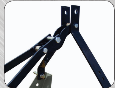
Flexible Floating Hitch