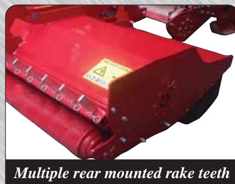
Multiple rear mounted rake teeth