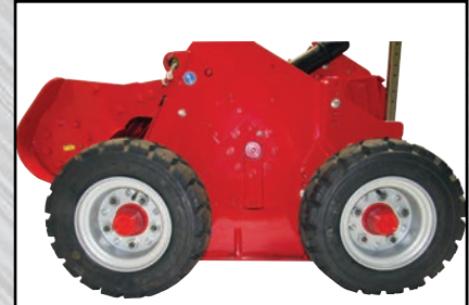
TWO DEPTH WHEELS AND SIDE SKIDS