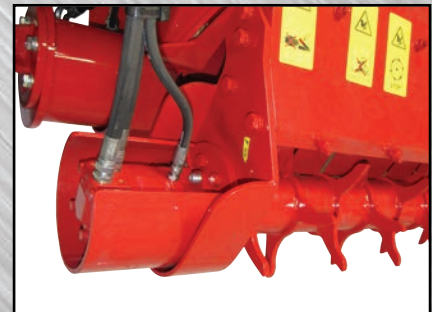
POWER FEED TO DUAL PICK-UP ROTORS