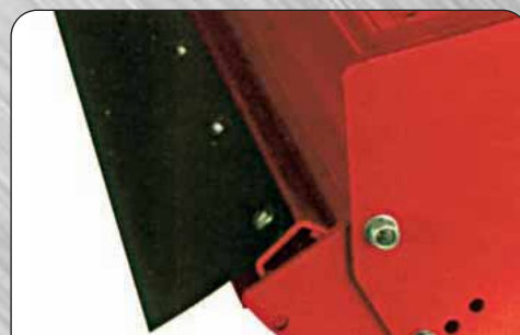
Adjustable Rear Deflector