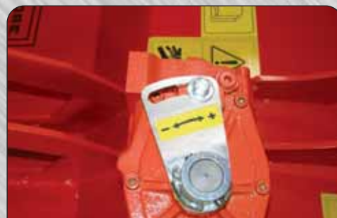
Piston Motor w/Adjustable Gallons Per Minute