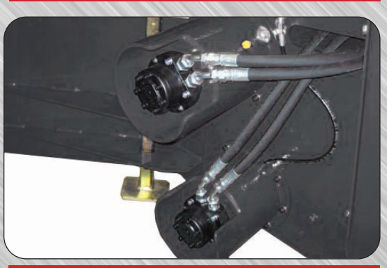
Two hydraulic motors power the feed rotors with protective casing