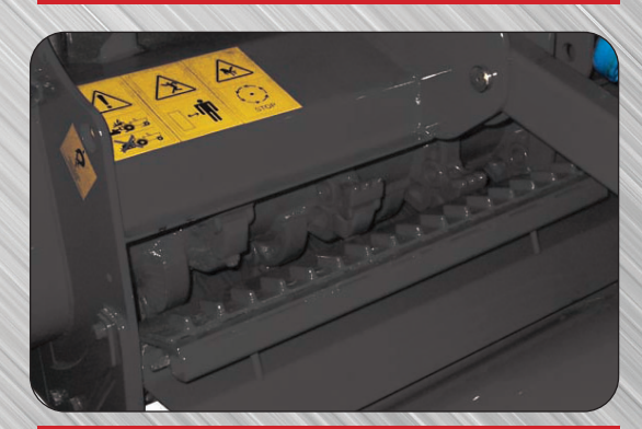
Two doors to access rotor and processing screen