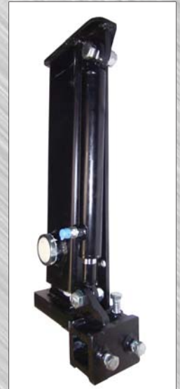
Optional hydraulic blade lift kit*