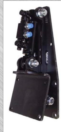
Optional hydraulic tilt kit*