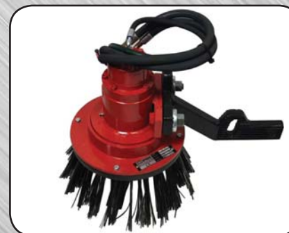
Rotary Berm Hoe with wire brush