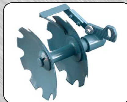
Back Fill Disc - is a non-retraction tool to rebuild berms at high speeds after the row line dries out