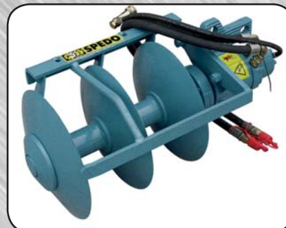
Power Disc - is the perfect tool to remove weeds and soil from the row line