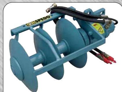
Power Disc - 3 Blades Retractable