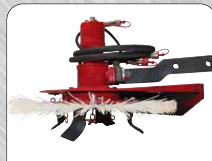
Rotary Hoe - 16" Retractable