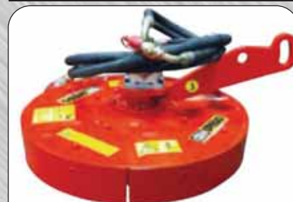
Rotary Mower - 24" Retractable