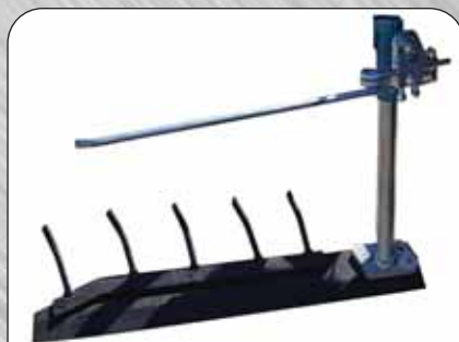
Blade - 24"