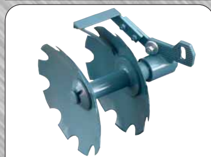
Back Fill Disc - 14" 2 Blades

Specifications Subject To Change Without Notice