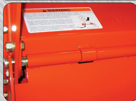
HEAVY HINGED TAILBOARD