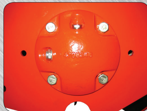
OIL BATH ROTOR BEARINGS