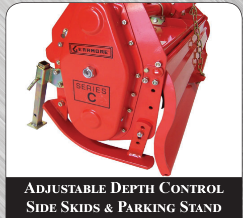
ADJUSTABLE DEPTH CONTROL SIDE SKIDS & PARKING STAND