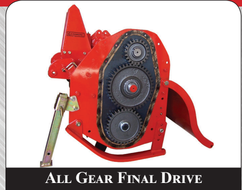
ALL GEAR FINAL DRIVE