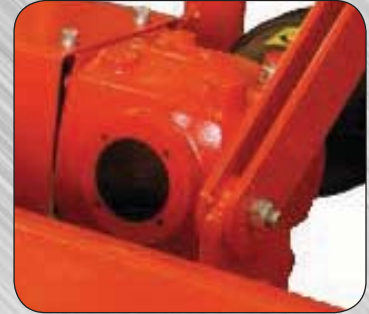
Heavy Duty 90 H.P. Gearbox