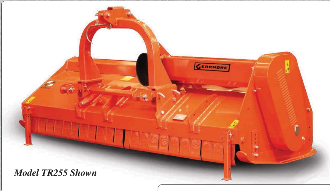
Model TR255 Shown

FEATURING OPEN TAILBOARD & ADJUSTABLE GAUGE WHEELS