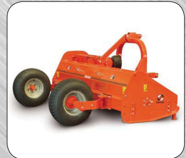
Gauge Wheels in Operating Position