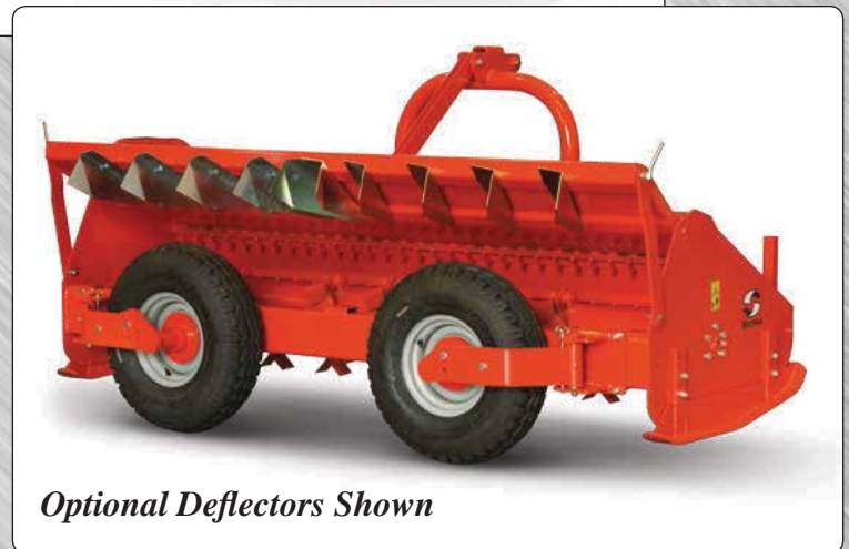
Optional Deflectors Shown

These units are excellent to achieve fine shredding of row crop residue, pastures and other types of farm usage.