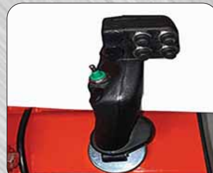
Joystick controls in storage position on cultivator