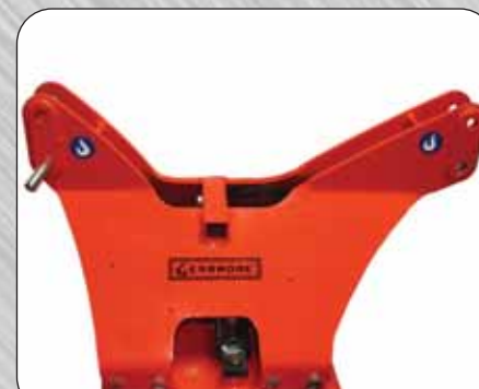
Double A Frame for rear or front tractor mounting