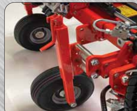
Screw Jack adjustable dual gauge wheels